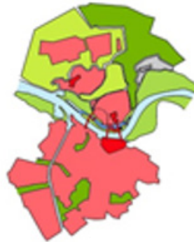
After development of flood bypass

Optional Diagrams and Photos https://worldlandscapearchitect.com/room-for-the-river-nijmegen-the-netherlands-hns-landscape-architects/#.XrvPghMzZQI