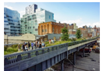
View of the High Line aerial greenway in New York, looking south at 20th Street.

The High Line, located in New York City, USA, is an old train line repurposed into an elevated linear park. The train line ran from the 1930s to the 1980s and was left abandoned afterwards. In the 2000s, inspired by the Promenade plantée (tree-lined walkway) in Paris the train line was redesigned as an aerial greenway. The High Line is now one continuous, 2.3km long greenway featuring 500+ species of plants and trees. On top of public space and gardens, the High Line is home to a diverse suite of public programs, community engagement, and world-class artwork and performances, free and open to all (High Line History, 2020). Apart from ecological benefits, the High Line attracts millions of tourists each year and thus increased surrounding property values by more than 100 percent (Patrick, D. J., 2011).